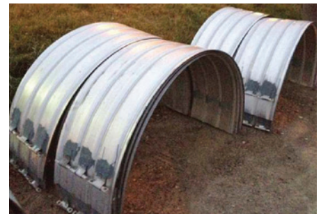
TWO PIECE - Triple bar and strap Huggerband