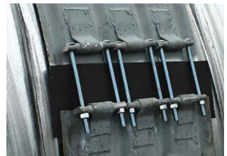
Huggerband w/ Neoprene Gasket

Armtec Huggerband couplers are available as a one or two piece triple bar and strap assembly - EXCEEDING THE CSA G401 MINIMUM TWO BAR AND STRAP REQUIREMENT.