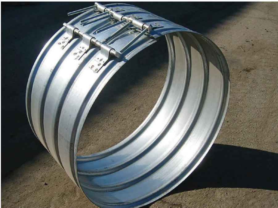
ONE PIECE - Triple bar and strap assembly

Available in a variety of coatings to provide a design service life of up to 100 years.